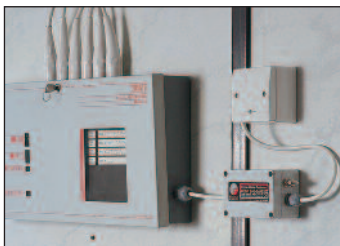
Ready boxed protector (here an ESP 240-5A/BX) installed on the fused connection (spur) to an alarm panel

If your supply is fused at more than 16 amps the ESP 120 M1, ESP 240 M1 or ESP 277 M1 are suitable.