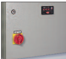
Front view of a cabinet with the display unit, easily visible, mounted on the front of the door, whilst the protector unit is installed deep within