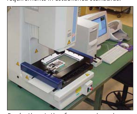
Production station for measuring crimp die nest heights.

Certificates supplied with each tool. If a tool has been certified, this means it has undergone 100% quality control. That means, all tools have been inspected in respect of handle pre-load force and crimp die nest heights in order to provide a terminal which is in accordance with requirements in established standards.